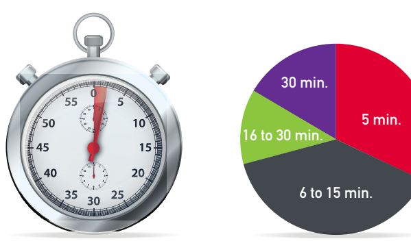
Average Smash & Grab Time - Less than 2 minutes

Dallas 3140 Towerwood Drive Dallas, Texas 75234 Tel. 972.243.3711 Toll. 800.225.2984 www.rollandsolutions.com